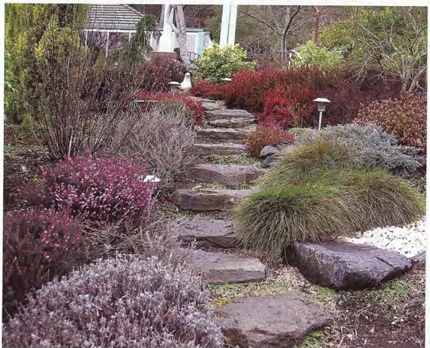
From top to bottom) A shot of the Albers Vista Gardens path to patio. 2. This shot is of the Bett Alber's Garden. 3. This picture depicts the winter color and scenery taken at the Albers Vista Garden.

Annual Membership in the Garden is $20 and includes access to all tours and events for the year. Suggested tour/event fee for non-members is $10 per person. For groups of 10 or more, a suggested tour/event fee is $7 per person. Donations of any amount gratefully accepted to further the mission of the garden. Additional information, including the remaining 2010 tours dates and topics are listed on the website, including photos can be found online at www.albersvistagardens.org .