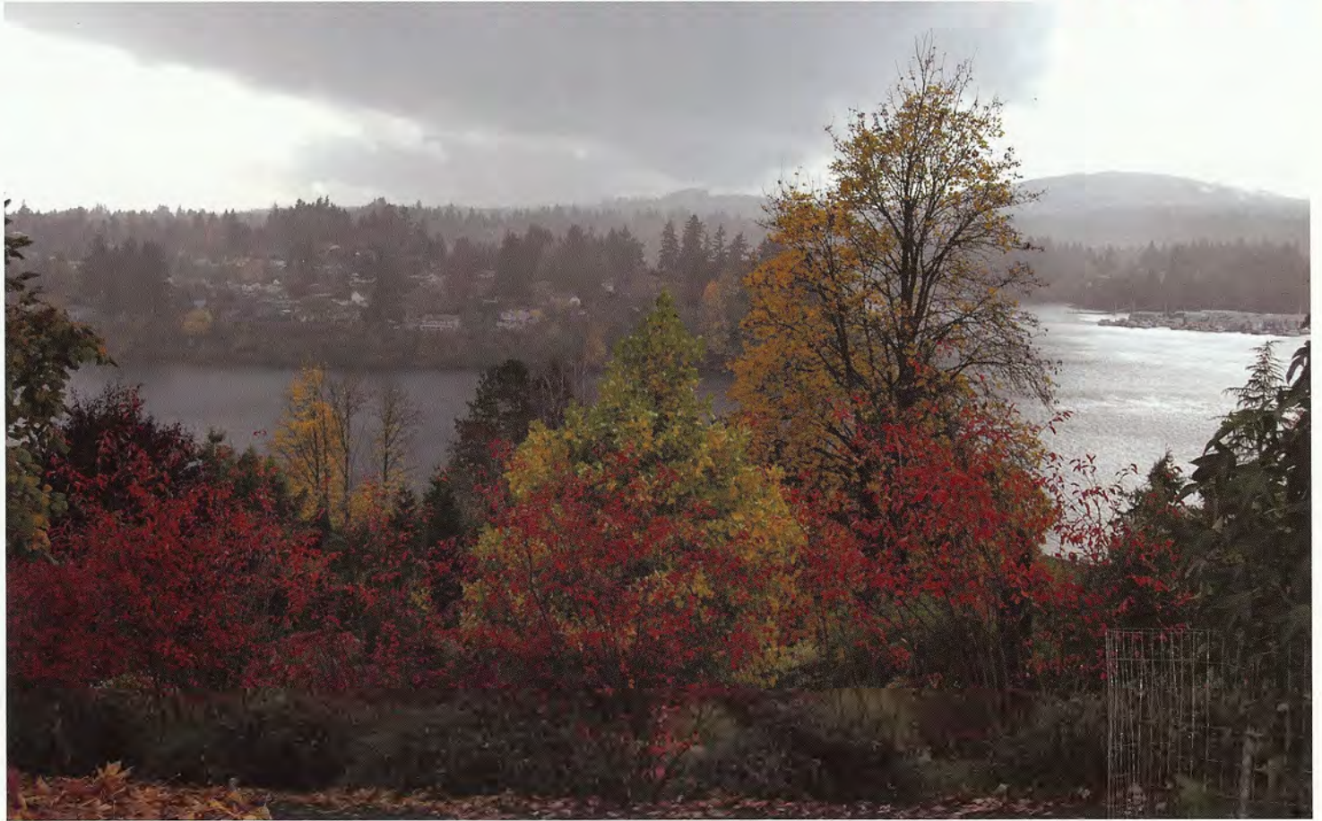
Albers Vista Gardens. Photo taken during Fall 2008.