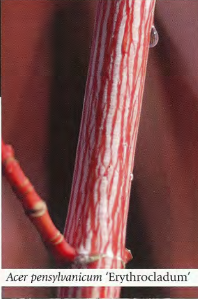
Acer pensylvanicum 'Erythrocladum'

16 Metro Parks Commitment to Sustainability